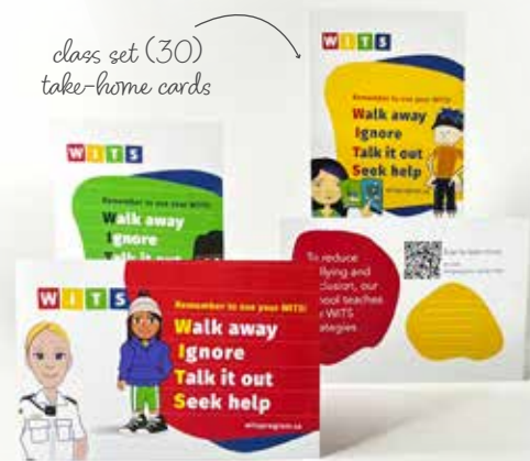
class set (30) take-home cards

Canada's leading provider of kindness education. We've been delivering the WITS Program to children for 25 years, impacting nearly one million Canadian children. School by school or district-wide, the WITS strategies are taught in elementary and public schools in every province and territory.