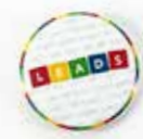
recognition & reminder gifts