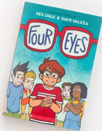
LEADS chapter books