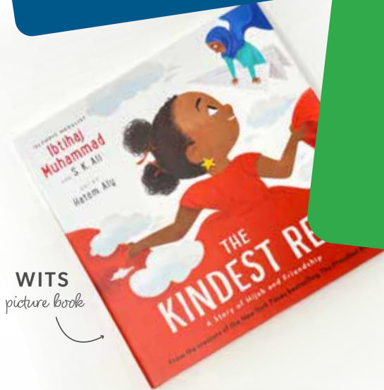
WITS picture book