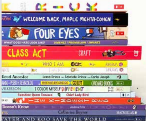
2025 Core Module picture and chapter books